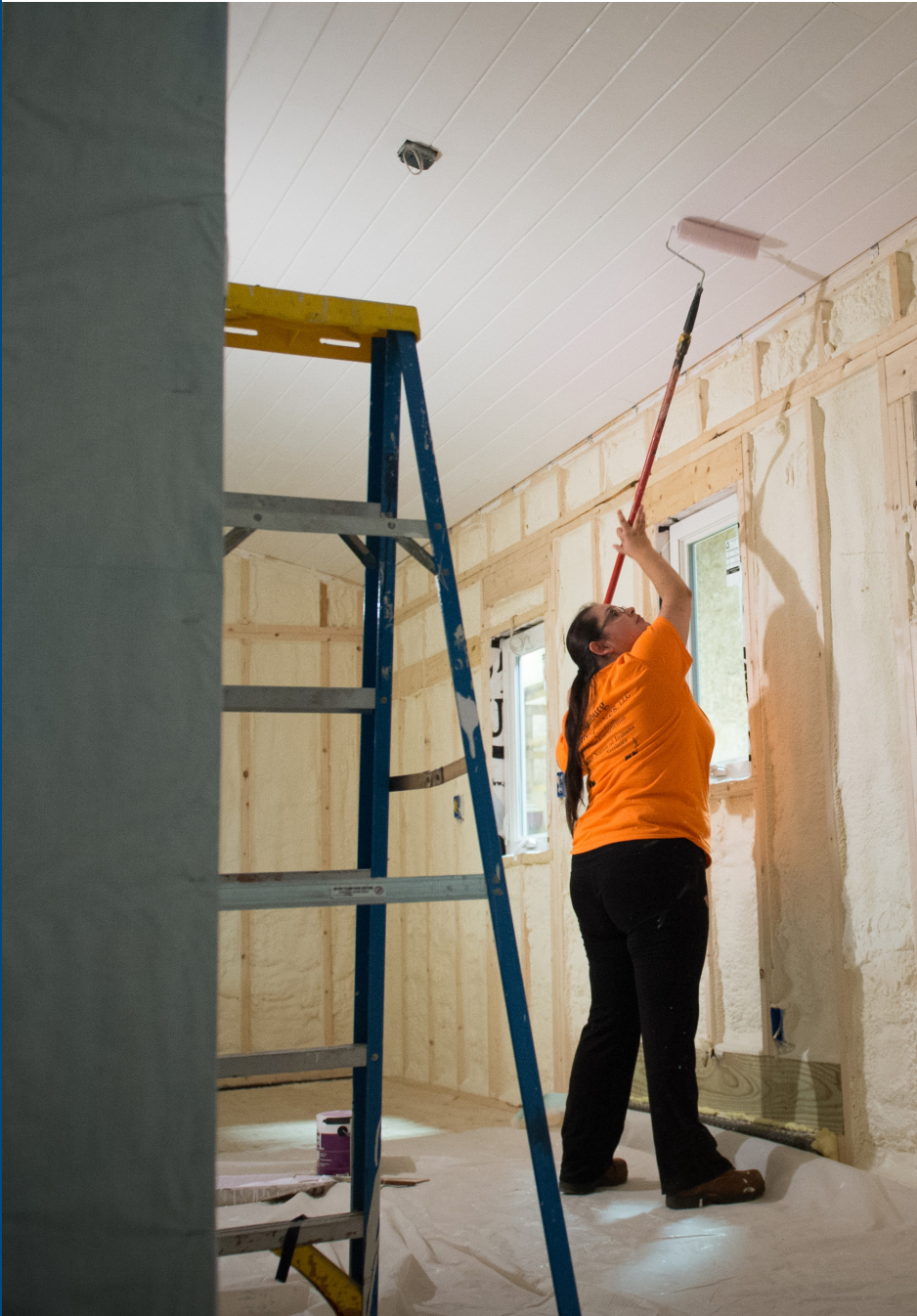
Seneca Nation of Indians, 2017 Prize Community