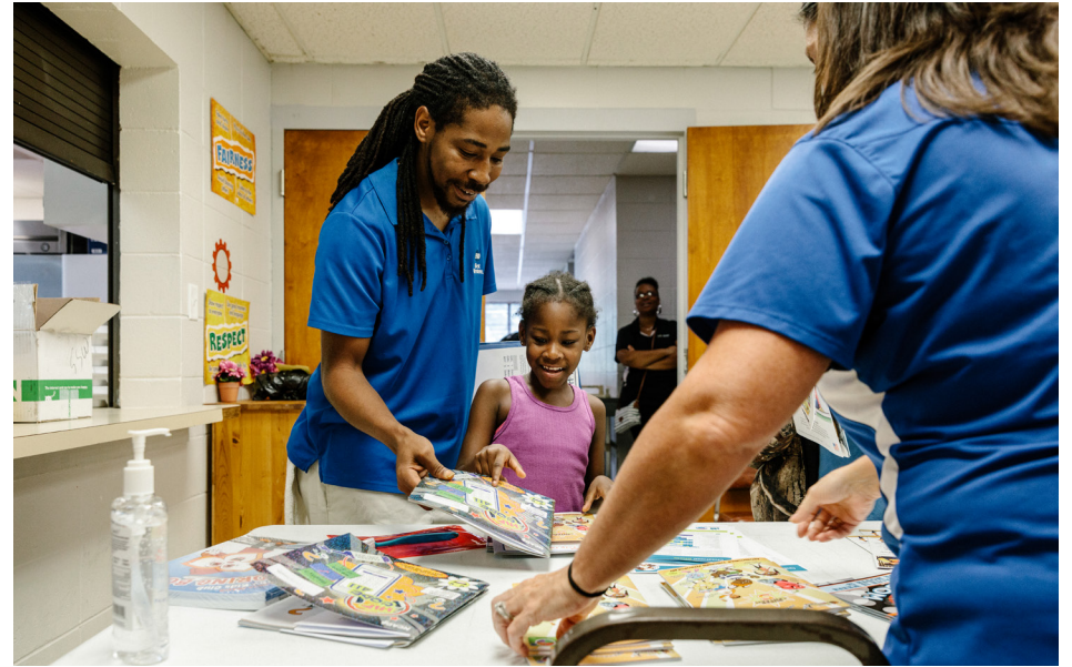
Vicksburg, MS, 2017 Prize Community