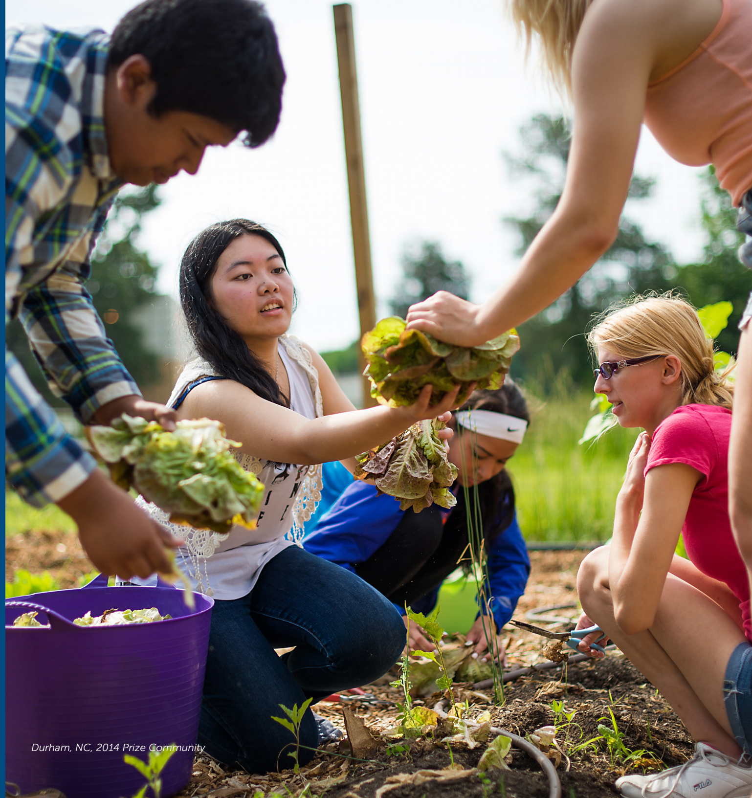
Durham, NC, 2014 Prize Community

University of Wisconsin Population Health Institute SCHOOL OF MEDICINE AND PUBLIC HEALTH