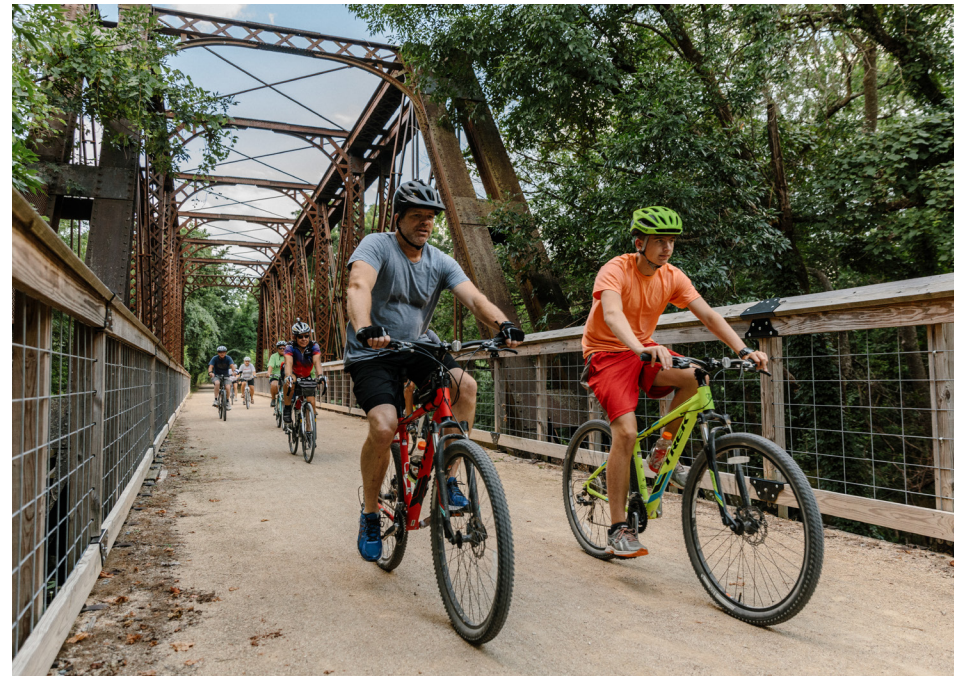
Allen County, KS, 2017 Prize Community