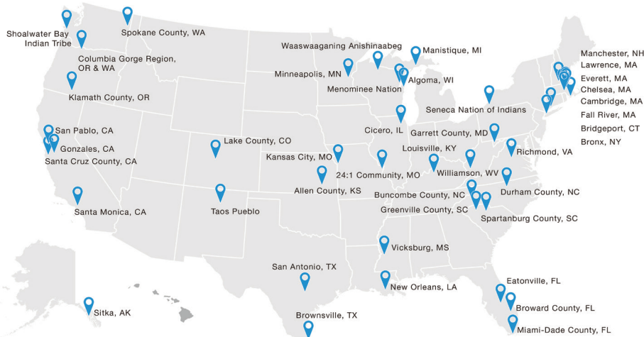
RWJF Culture of Health Prize Winners 2013-2019